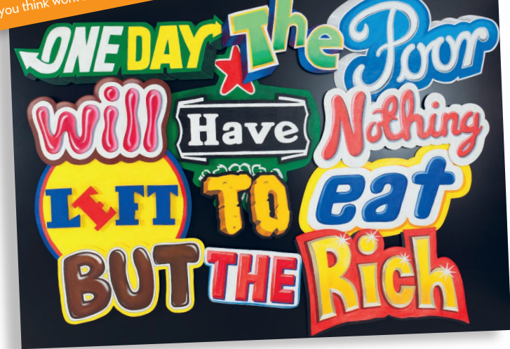
Jani Leinonen. One Day, 2011. Acrylic on wood, 186 x 261 cm.