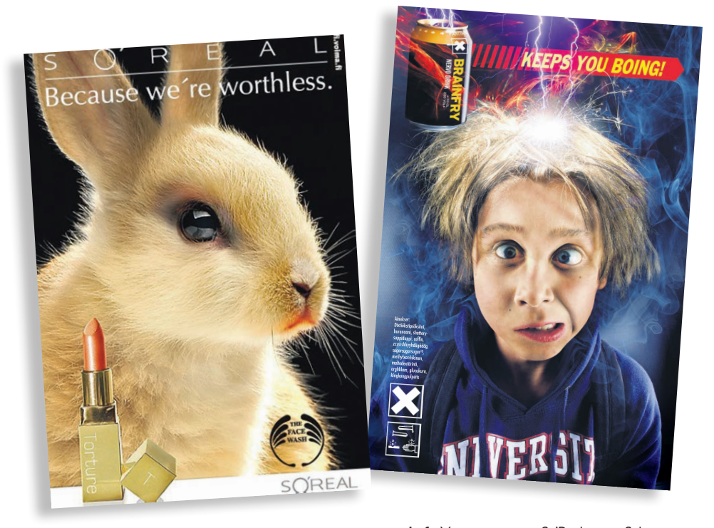
Left: Voima magazine. So'Real, 2009. Subvertisement. Right: Voima magazine. Brainfry, 2011. Subvertisement.