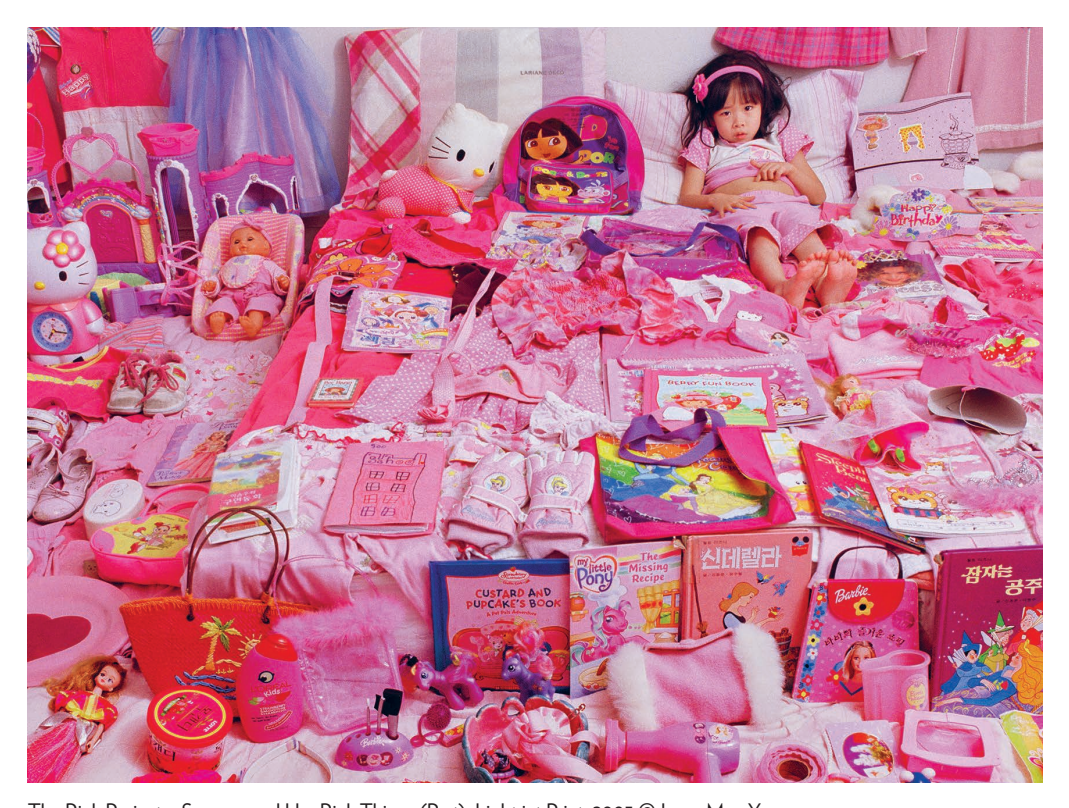
The Pink Project – Seowoo and Her Pink Things (Part), Light jet Print, 2005 © JeongMee Yoon.

AIM: To strengthen media literacy and open up means of culture jamming by examining photos, videos and a subvertisement gallery together.