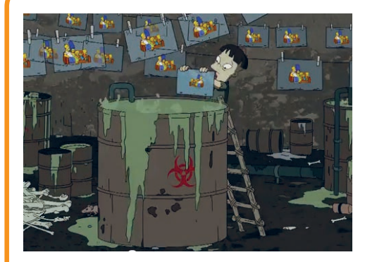
Banksyfilm Simpsons, 2010. Youtube: www.youtube.com/watch?v=DX1iplQQJTo.

The couch gag made for and shown in the animated TV series The Simpsons by the street artist BANKSY raises questions about the wellbeing of adults, children, animals and the environment in the production of the series and its merchandise. Discussions of this video are best facilitated by asking students in pairs to write down their questions about the video on sticky notes.