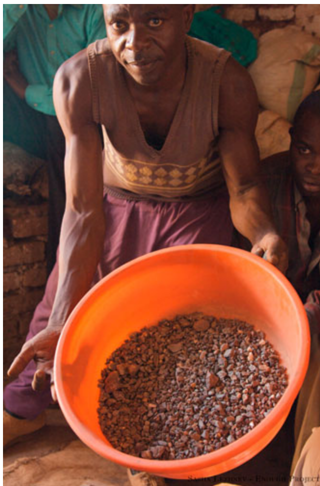
Local tin ore (cassiterite) trader.

in Eastern DRC where there are no security problems at all. 99 In other words, if there are very strict requirements regarding taxes to armed groups and no involvement of armed groups in the mineral trade at all, at the moment, it means it is not possible to source minerals from Eastern DRC at all. This is an option that Karen Hayes foresees could lead to more insecurity in the region: “Potential exclusion of mines from the traceability system with resulting loss of their legitimate market could have major impacts. This could leave mines with the options of (a) closure – resulting in loss of livelihoods, migration forced by economic need, new resource conflicts as miners try to find new sites, new debt as new sites are developed, etc; (b) continued mining and trading but with only illegal actors or buyers who are unscrupulous about their sourcing; (c) a move away from the restrictive tin/tantalum/wolframite market towards the more lucrative and secretive gold mines and markets where traceability is a huge challenge.” 100