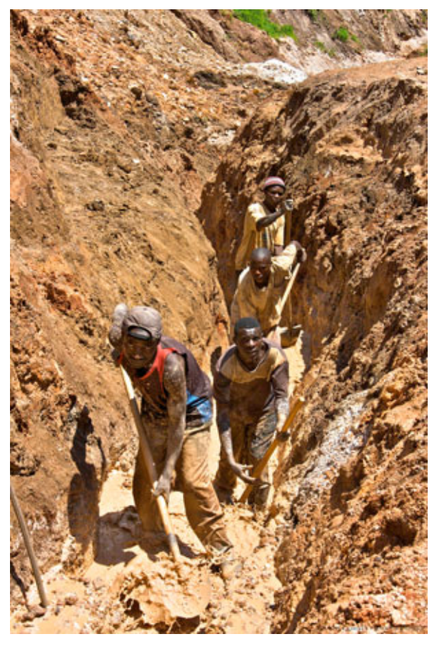
TANTALUM MINING IN SOUTH KIVU.

Nokia is also working on supply chain due diligence but it mostly relies on in-house assessors. The company does not, as a matter of routine, employ independent assessors or auditors to verify the conflict minerals due diligence information of their first tier suppliers. Nokia's third party validation efforts are currently focused on the smelter level via the conflict-free smelter program.