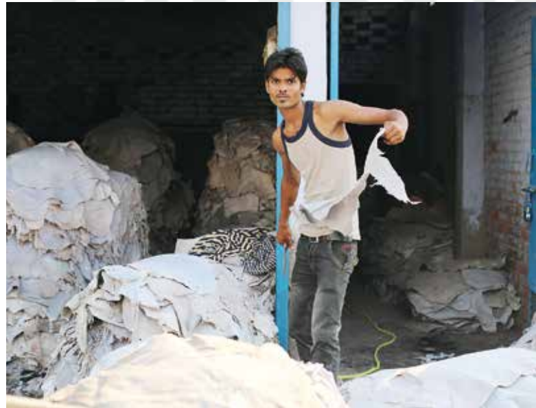
Tannery worker in Uttar Pradesh