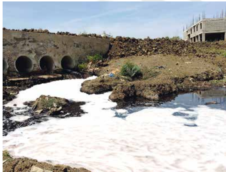
Water pollution related to chrome tanning

Improper disposal of solid waste and ineffective treatment of tannery effluent have caused damage to soil, crop growth and water resources. Even though the Indian environmental regulations for the tanning industry are as stringent as international regulations, there is a wide gap between those regulations and their implementation by the tanneries.