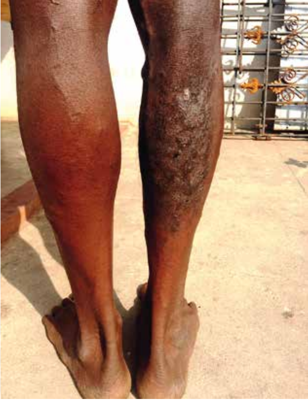
Tannery worker suffering from skin disease