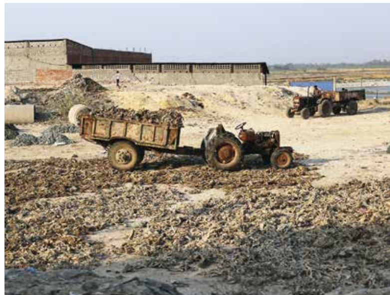
Disposal of solid waste on river banks